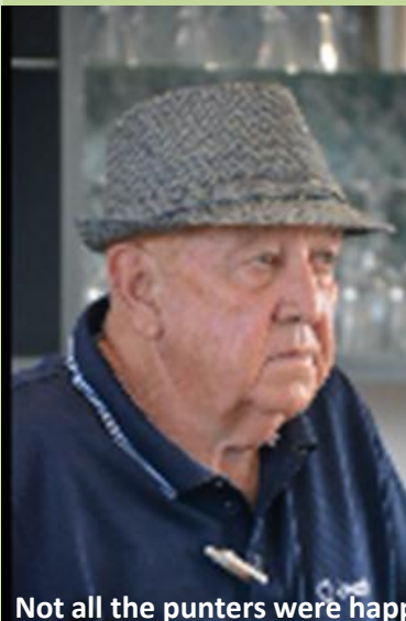
Not all the punters were happy!