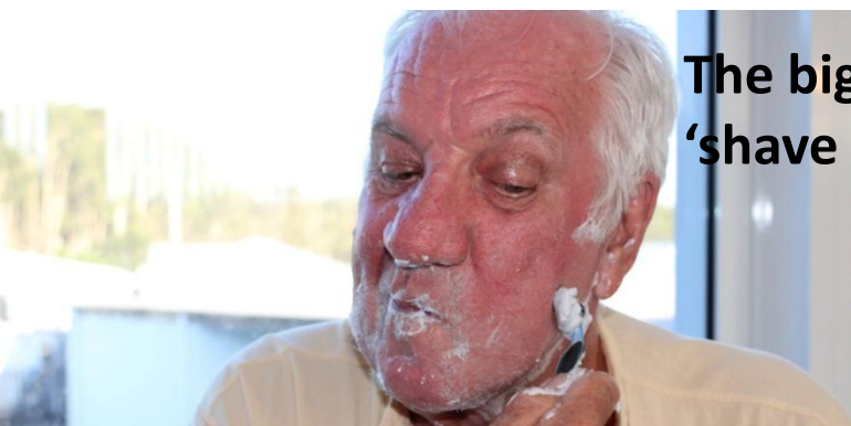
The big 'shave off'

This year, the participants in the Movember fund raisers were able to present a cheque to the Movember Foundation for in excess of $3000. Well done to the participants but especially to all those who donated to this worthy cause.